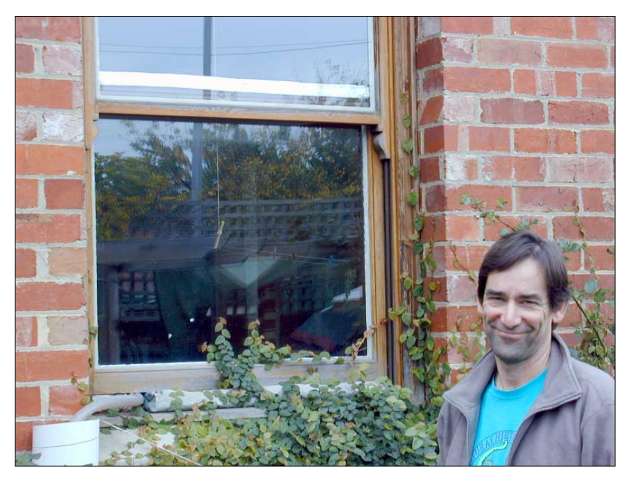
You'd be happy too if you double glazed your house for $30 a window!

There are a number of benefits of double glazing that I can see.