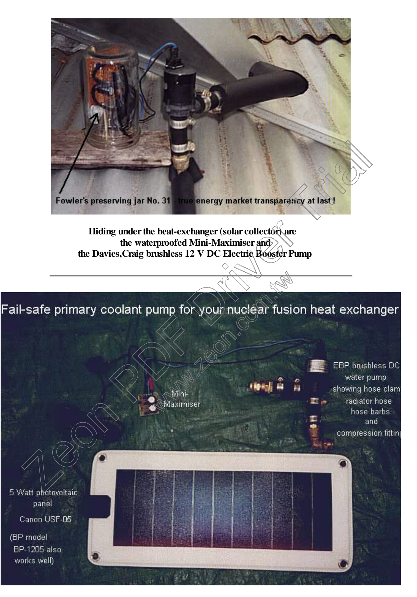
Fail-safe = pump operation is mandated by the energy flux from your fusion reactor core.